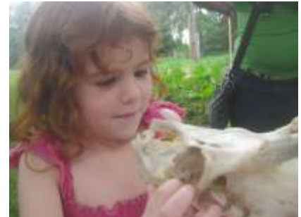
Examining a deer’s skull