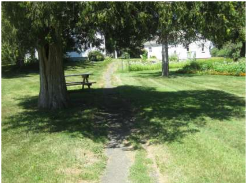
A welcome spot of shade, July 22.

Don't Forget- Picnic and Games Night, August 3 at 6pm. All friends and neighbors are invited!