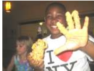
Peanut butter hands-